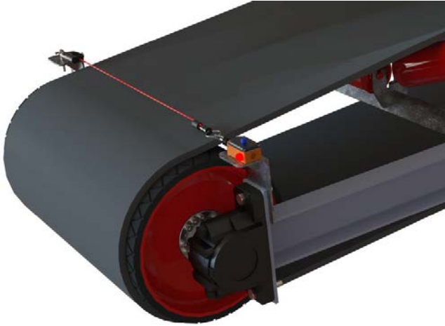
Belt rip detector application across the tail end pulley section.

ZS 71 Wire Kit contains essential accessories, including: