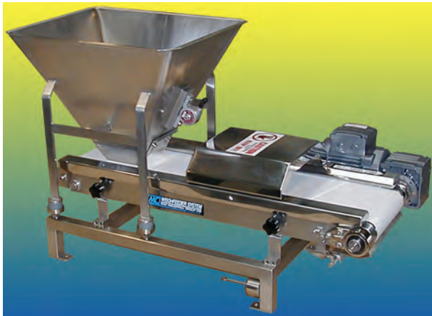
Stainless steel Weigh Feeders for hygienic food applications

Options include galvanised and stainless steel construction. Fully enclosed versions (for dust control requirements) are also an option as are hermetically sealed stainless steel loadcells.