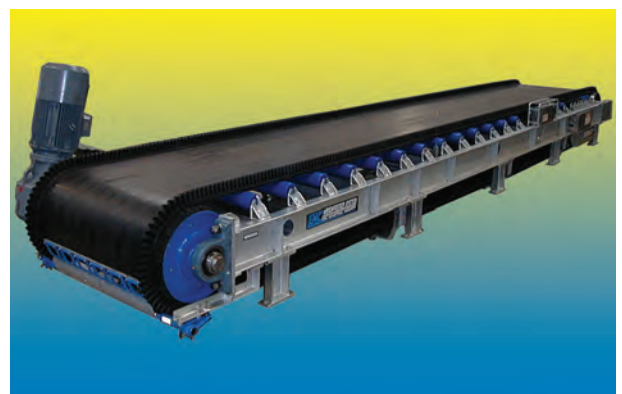
Large coal Weigh Feeder. (9 metre drum centres)