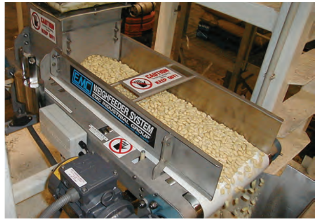
Weigh Feeder for nut products

* Maximum flow rate is calculated using a theoretical material bulk density of 600kg/m 3 and a belt speed of 15m/min. Sizing of your weigh feeder will depend on your actual product.