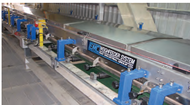
Fully enclosed system installed at cement plant