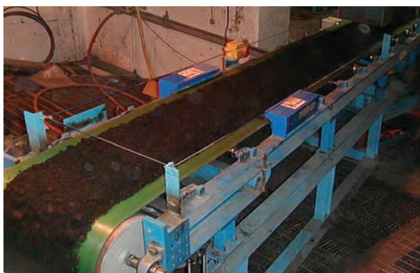
Coal Weigh Feeder at cement plant