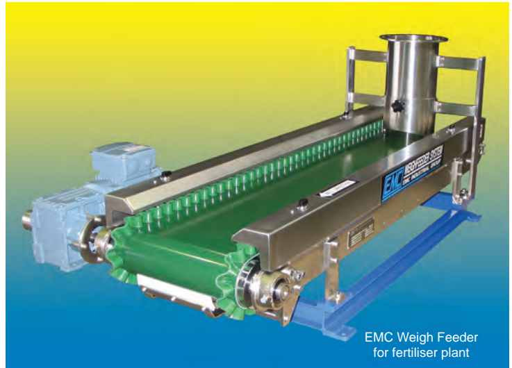
EMC Weigh Feeder for fertiliser plant

Our experienced staff and fully equipped workshops ensure that full local back-up and service is provided throughout New Zealand.