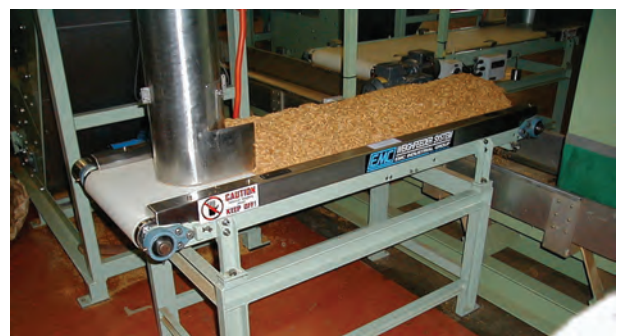
Weigh Feeder installed at tobacco plant