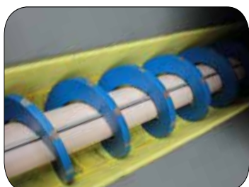
SINT™ Self Cleaning Drainage