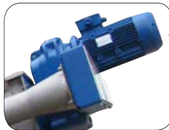
Single drive unit for drum and conveyor screw