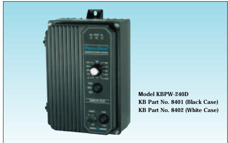
Model KBPW-240D KB Part No. 8401 (Black Case) KB Part No. 8402 (White Case)