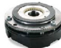
INTORQ BFK458-L LongLife Spring-applied Brake