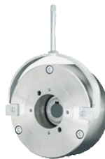
INTORQ BFK470 Spring-applied Brake