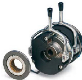
INTORQ BFK458 Double Spring-applied Brake