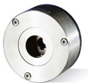
INTORQ BFK461 Spring-applied Brake