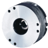
INTORQ BFK457 Spring-applied Brake

We now supply the complete range of Intorq Motor brakes and Components. We stock all sizes including spare parts. The Intorq motor brakes are made to suit all major electric motor manufactures specifications. Customisation available.