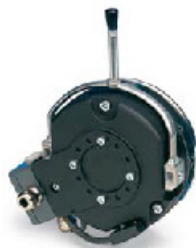
INTORQ BFK458 Spring-applied Brake