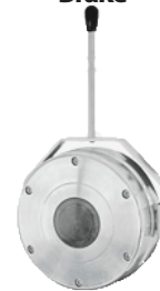
INTORQ BFK471 Spring-applied Brake